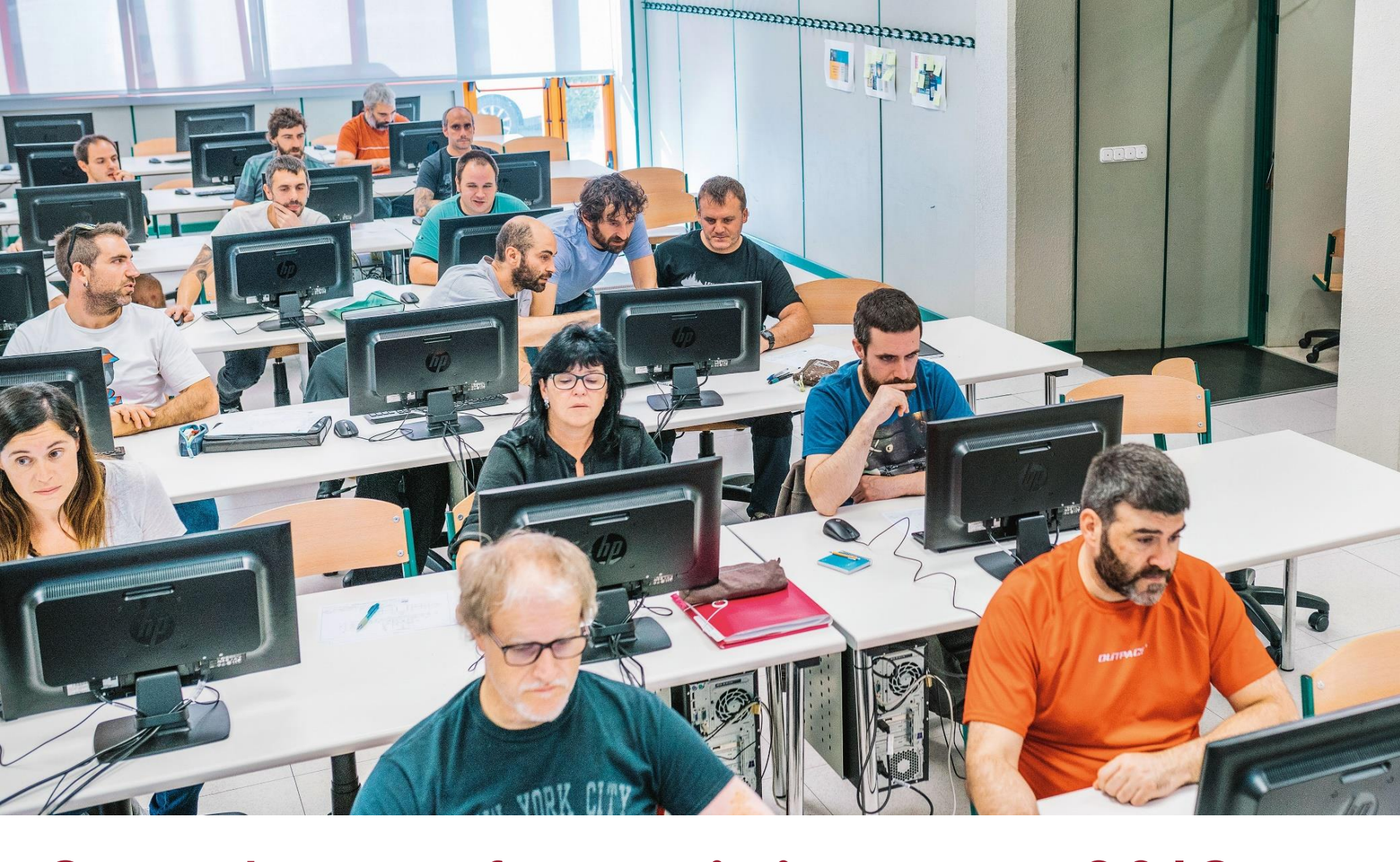
Special case of retraining since 2013 for 200 members