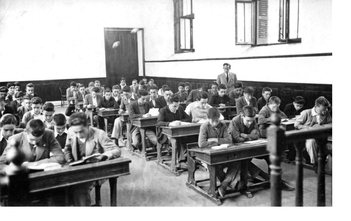
1943 Escuela Profesional