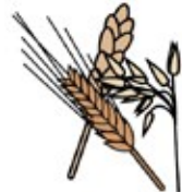
CONTAINING CEREALS GLUTEN CRUSTACEANS