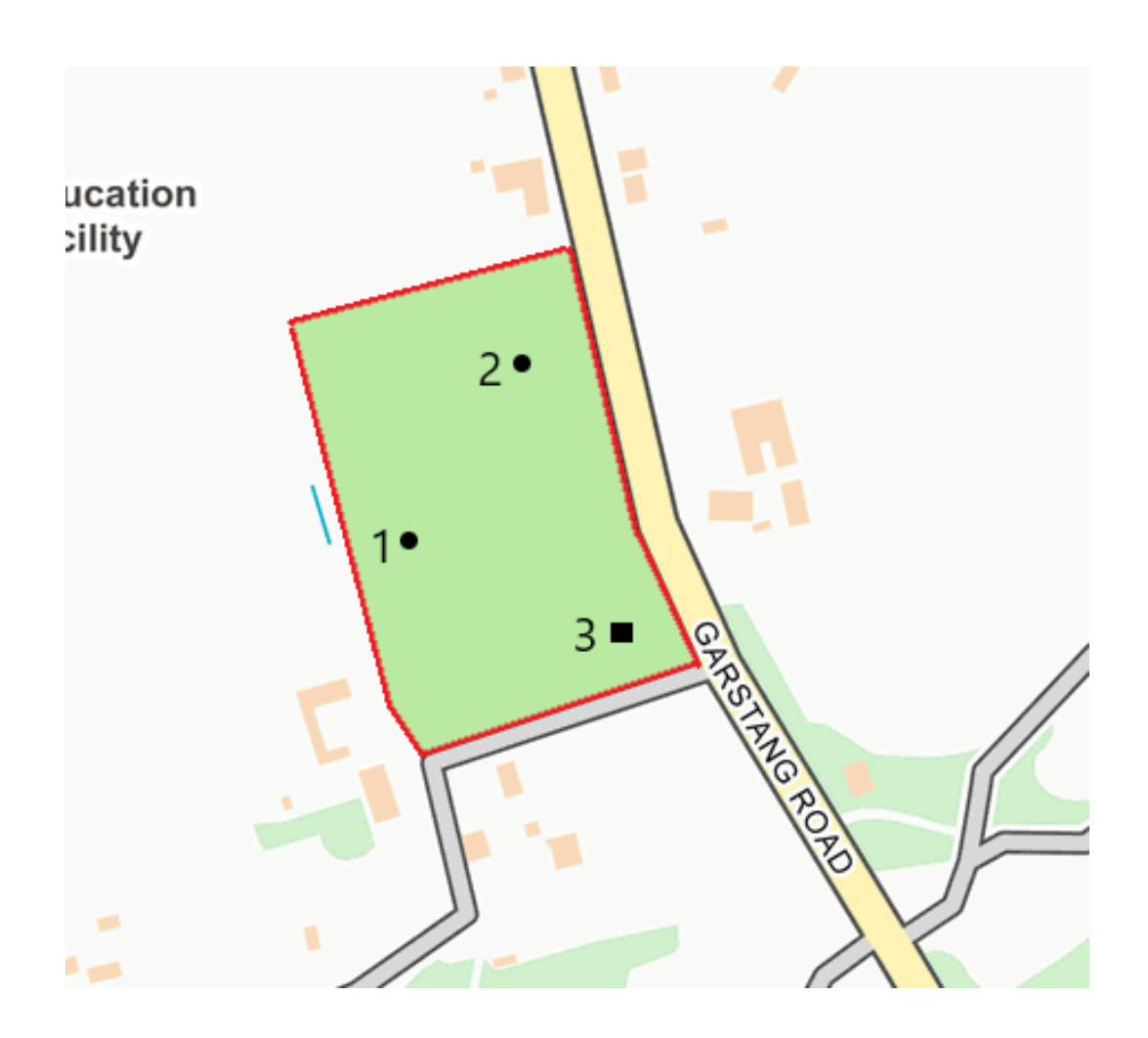
Ordnance Survey copy licence PMR0046161