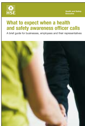
This is a web-friendly version of leaflet WCOVL100

A brief guide for businesses, employees and their representatives